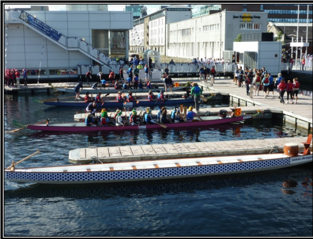
Boat Loading Area at the Visitor's Centre