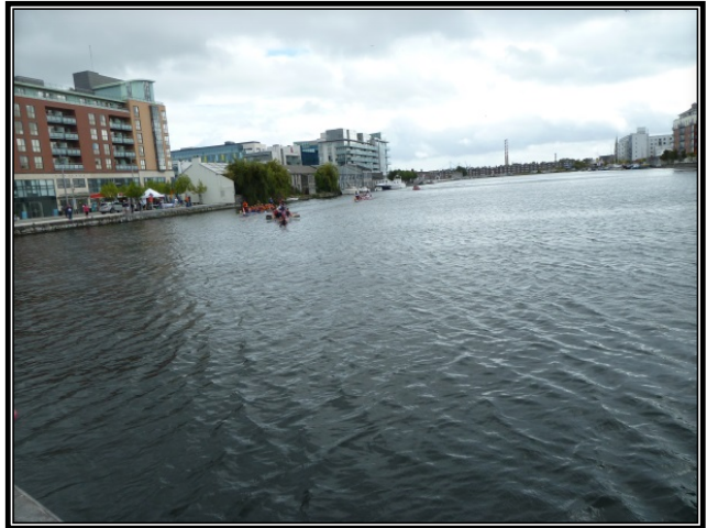
Grand Canal Dock - Race Course