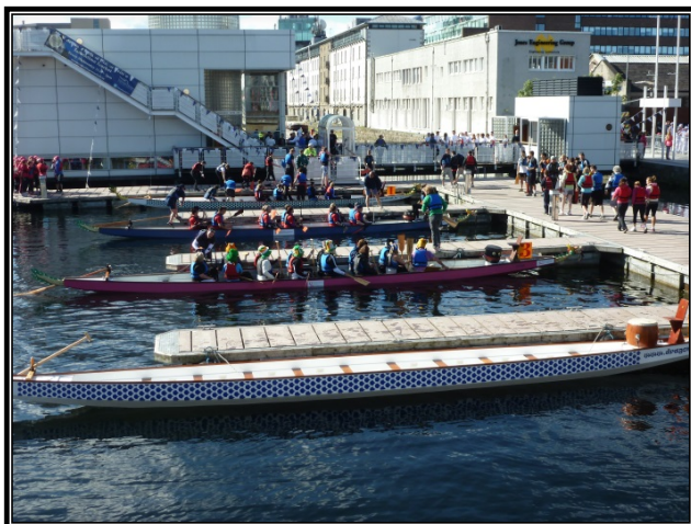
Boat Loading Area at the Visitor's Centre