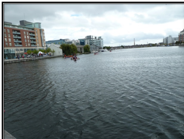
Grand Canal Dock - Race Course