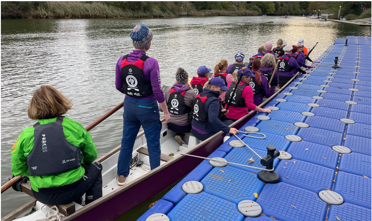
Lagan Dragons, Belfast at their new club location