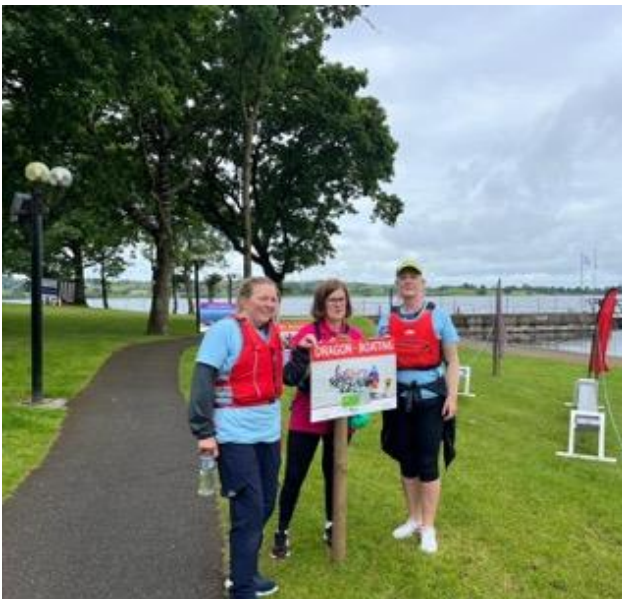
Watersports Inclusion Games 2024 – Lough Ramour

In 2024, the Irish Dragon Boat Association had the privilege of taking part in the Watersports Inclusion Games, hosted for the first time in County Cavan at the scenic Lough Ramor. The event brought together over 523 participants and 278 volunteers for a weekend filled with discovery, fun and the spirit of community. Dragon boating quickly emerged as one of the standout activities, giving participants the chance to paddle in unison, build confidence, and experience first-hand the joy of teamwork on the water.