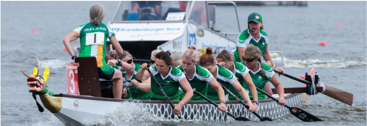
The team battling it out in the 200m

With this historic debut behind them, the team is already setting sights on future championships. Their performance in Brandenburg has laid the foundation for more Irish crews to take part in international events and inspired a new generation of paddlers across the country. Next stop is the EDBF European Nations Championships in Munich, Germany in July 2026.