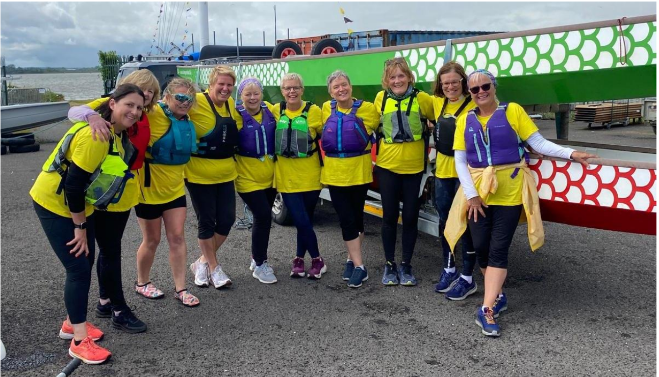
Watersports Inclusion Games 2025 – Malahide Yacht Club

The IDBA is proud to play its part in this movement and looks forward to contributing to future Games.