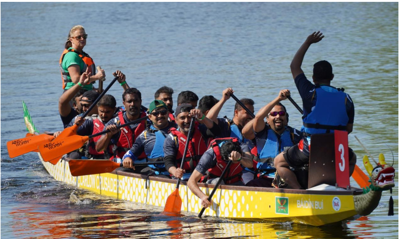
It's all about having fun!