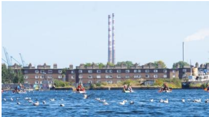
Dragons At The Docks 2022

Teamwork strong, a unified force, Following a practiced course. Oh, to be a dragon boater, free, Part of something wild, you see.