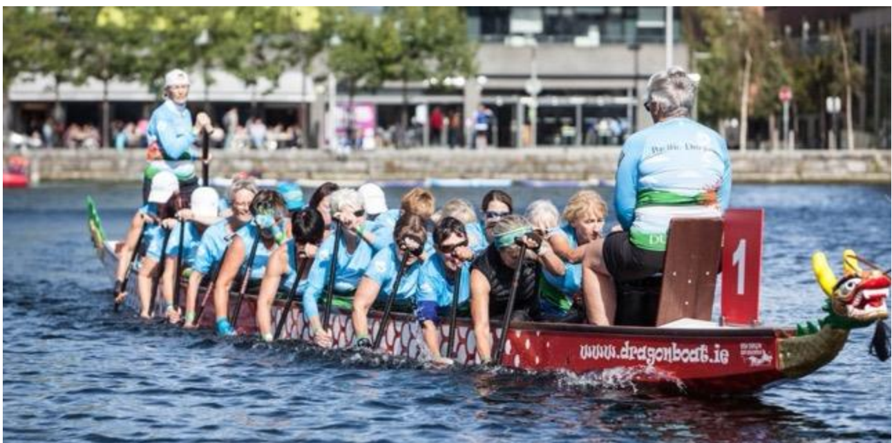
Pacific Dragons from Canada at the Dublin Dragon Boat Regatta 2019