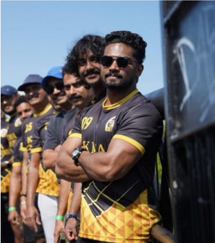
This Team Means Business!

The Kerala House Boat Race brought the vibrant traditions of Kerala to Ireland in a lively multicultural celebration. Now in its third year since launching in 2023, the event saw a record number of team entries and drew huge crowds. An array of stalls offering traditional Kerala cuisine added to the festive atmosphere, while the racing itself was fiercely competitive, showcasing both community spirit and cultural pride. The event was even livestreaming direct to India.