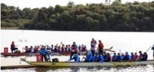
Medb’s Dragon Warriors