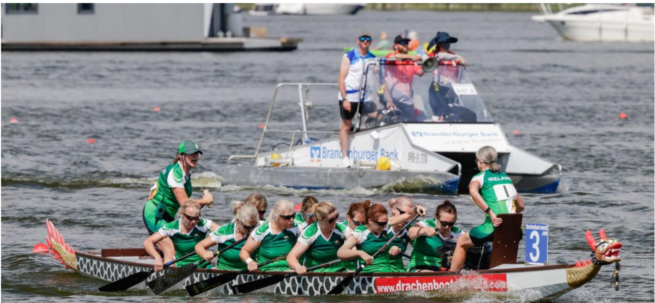
Irish Senior A Women's Team – 500m

The highlight of the year for Irish dragon boating was undoubtedly the return of the Irish Senior Women's Dragon Boat Team to international competition. From 14 th – 20 th July 2025, the team represented Ireland at the prestigious 17th IDBF World Dragon Boat Racing Championships in Brandenburg an der Havel, Germany. This marked the first-ever appearance of an Irish senior women's team at the World Championships, a milestone moment for the sport in Ireland.