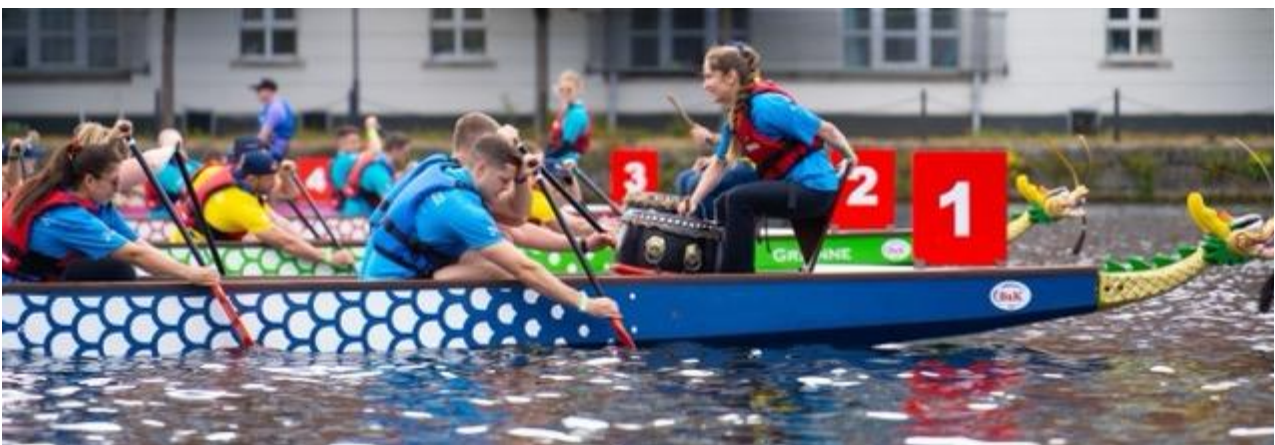
Are You Ready? Attention! Go!

Since its launch in 2017 the event has raised more than €1.1 million. The primary beneficiary was the Dublin Simon Community which used the donations to expand housing initiatives for individuals and families experiencing homelessness. Other charities supported over the years also included Aware, Alone, ISPCC and Women’s Aid, ensuring the impact of the event reached across multiple areas of need. Organizers highlighted the unique spirit of the regatta: “It’s not just about winning races — it’s about uniting the industry to make a difference,” said one spokesperson.