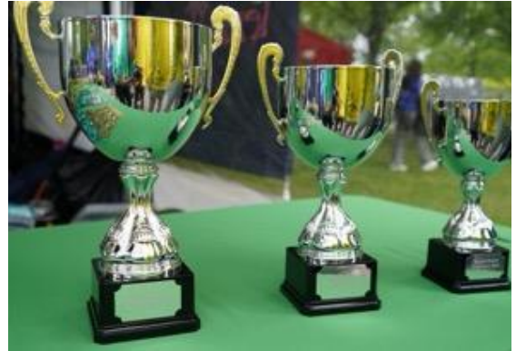
Trophies Up for Grabs