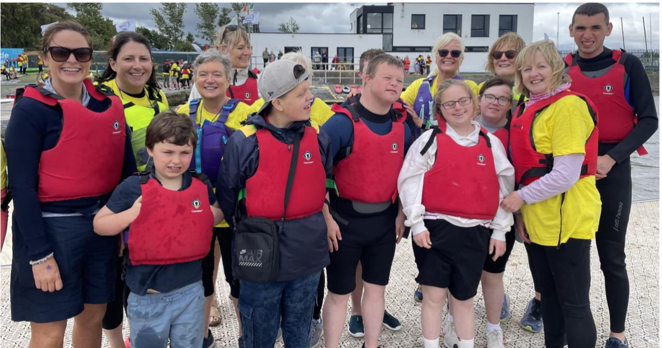
Watersports Inclusion Games 2025 – Malahide Yacht Club