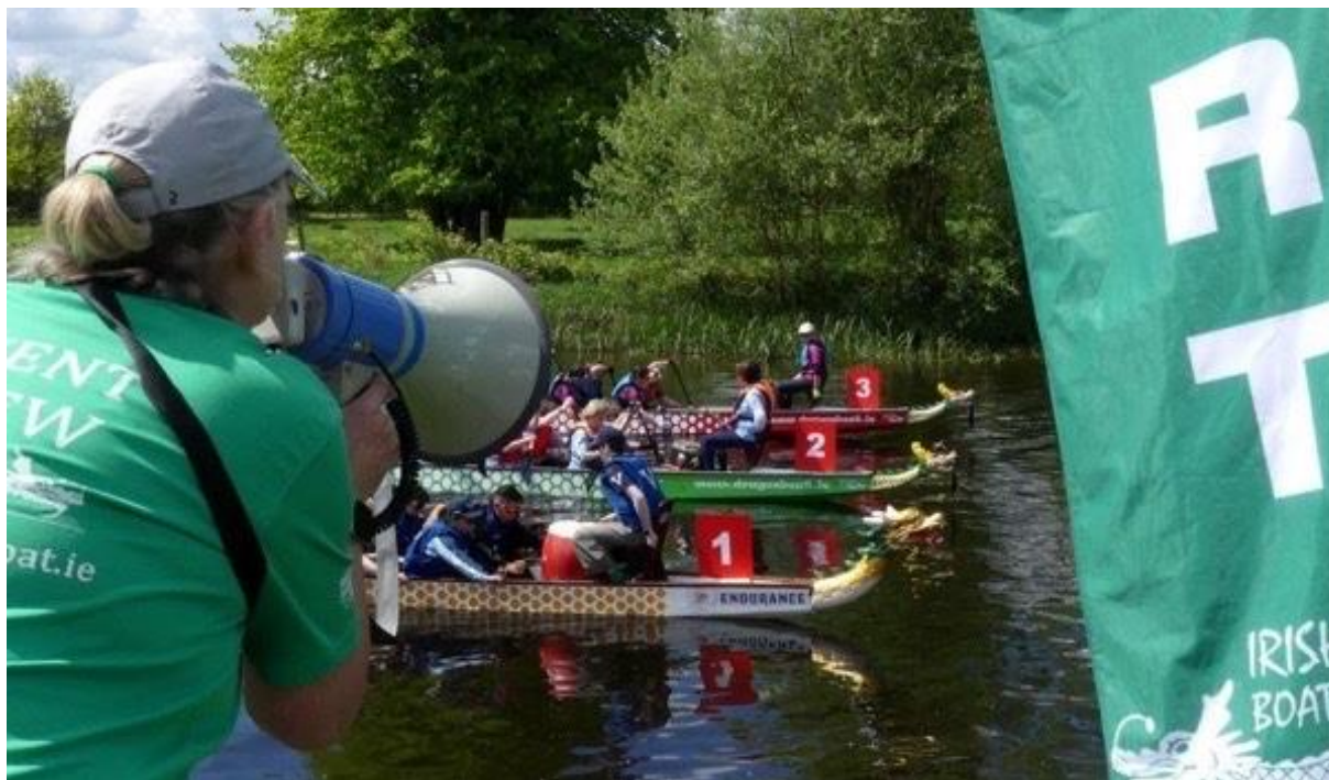
Athy Dragon Boat Regatta – Start Line

The season kicked off in style as crews charged down the River Barrow in a fast-paced 200m sprint, setting the stage for a highly competitive year ahead. Barrow Dragons claimed victory in the U18 category, Carlow Dragons topped the Women's division and Belfast Phoenix Paddlers powered to first place in the Open race category. With clear skies and lively crowds along the riverbanks, the atmosphere was vibrant and full of excitement.