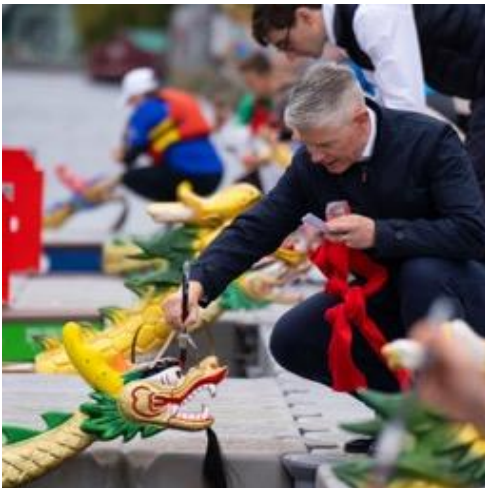
DATD 2024 Eye Dotting Ceremony

2024 saw the final edition of Dragons At The Docks (DATD) where annually 80+ teams from Ireland’s property and construction sectors took to the water competing in dragon boat races whilst raising vital funds for homelessness and community support charities. Unfortunately, the event had reached a natural conclusion as entries had gradually declined.